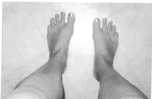
FIGURE 1. Redness and swelling in the lower extremities of our patient with erythromelalgia.

The initial MT assessment showed limited active and passive range of motion of the extremities because of hypertonicity in the muscles. The patient monitored her pain and discomfort using a pain scale of 0 – 10 (0 = no pain, 10 = extreme pain) (8) . On initial assessment, the patient reported pain in the distal extremities as 8 bilaterally. She indicated experiencing more pain in the evening, peaking at night before bed, and she described experiencing painful symptoms of erythromelalgia approximately 3 – 4 days each week, with episodes lasting between 24 and 72 hours. She described the characteristics of the pain in the lower extremities as a cramping pressure, and she provided a photograph of the distal extremities showing redness and swelling as a result of erythromelalgia (Figure 1). Aggravating factors for the patient included extreme