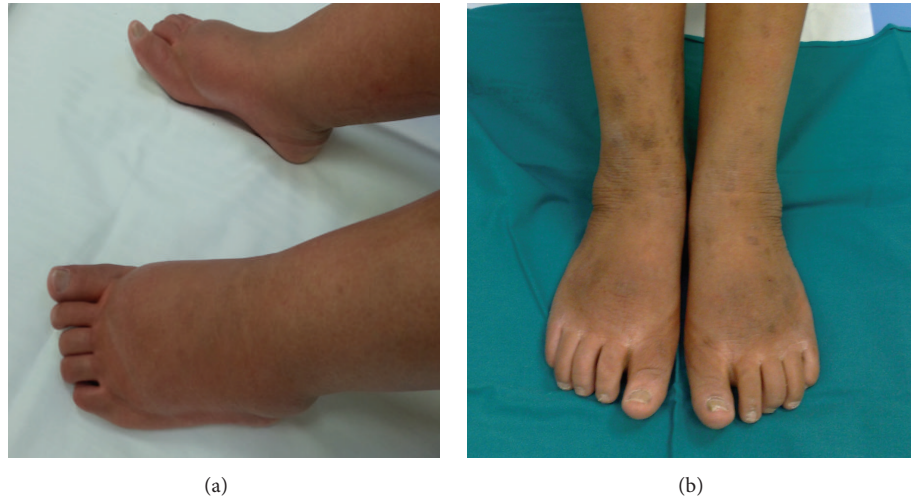
FIGURE 2: Patient legs and feet delaying pump recharging of 4 days (a) and after one week of pump recharging with usual dosage of Ziconotide (b).

severe chronic pain who are intolerant of and/or refractory to other analgesic therapies. Ziconotide is the synthetic equivalent of a 25-amino-acid polybasic peptide found in the venom of the marine snail Conus magus [14]. The mechanism of action of Ziconotide involves a potent and selective block of neuronal N-type voltage-sensitive calcium channels at the presynaptic level [15, 16], thereby inhibiting neurotransmission from primary nociceptive afferents. Ziconotide produces potent antinociceptive effects in animal models [17] and its efficacy has been demonstrated in human studies [18]. The analgesic efficacy of Ziconotide likely results from its ability to interrupt pain signaling at the level of the spinal cord. Importantly, prolonged administration of Ziconotide does not lead to the development of addiction or tolerance [19].