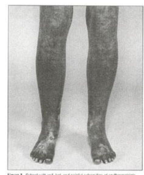
Figure 1. Patient with red. hot, and paintul extremities of arythrometalgia

At the time of presentation, the average duration of symptoms varied from less than I month to 26 years (mean, 47.6 t 59 months; median, 24 months). Symptoms had been present since childhood in 7 patients (4.2%). Symptoms were intermittent in 163 patients (97.0%) and constant in 5 (3.0%). Feet were involved in 148 (88.1%), hands in 43 (25.6%), and legs in 23 (13.7%). Other sites involved were ears (1 patient), neck (1 patient), and face (4 patients).