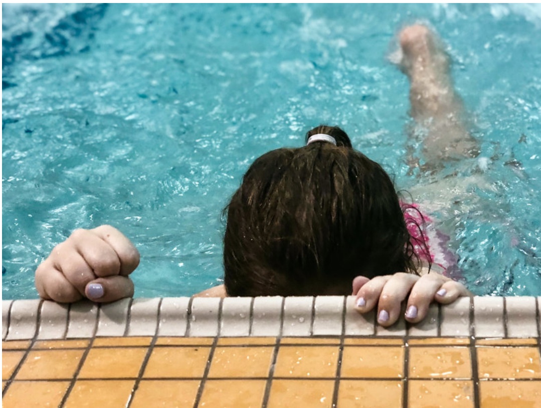
Because of amplified pain, one patient was not able to unclench her right hand.