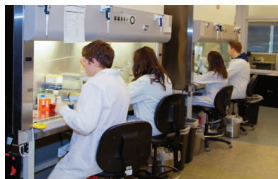
Research continues on EM pain blockers.